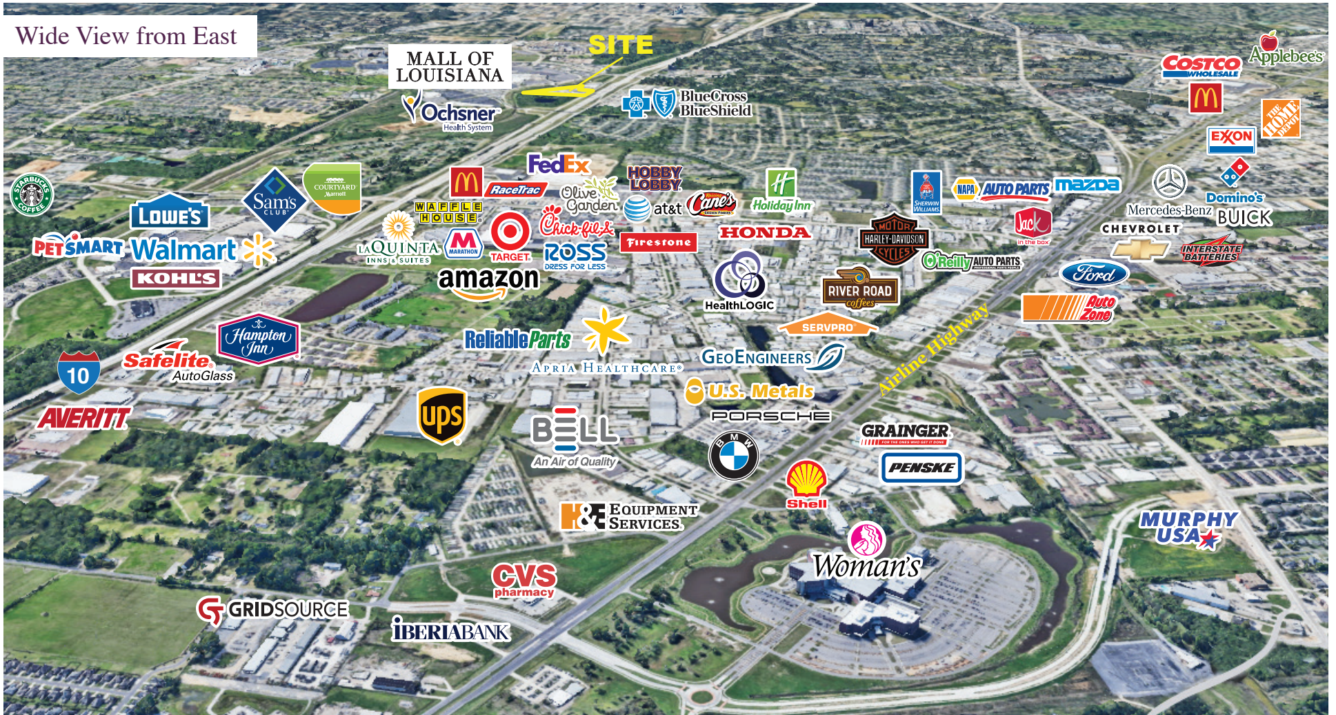
Wide View from East

All information furnished is from sources deemed reliable. No warranty or representation is made as to the accuracy thereof and it is submitted subject to errors, omissions, changes of availability, price, rental or other conditions.