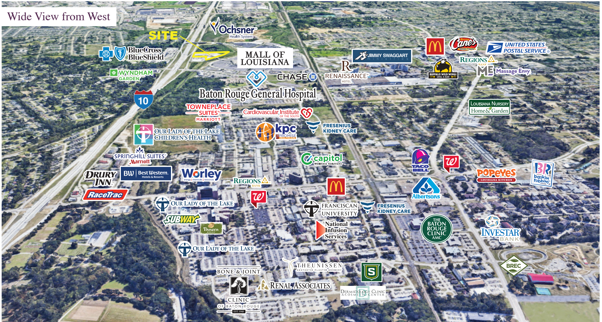
Wide View from West

All information furnished is from sources deemed reliable. No warranty or representation is made as to the accuracy thereof and it is submitted subject to errors, omissions, changes of availability, price, rental or other conditions.