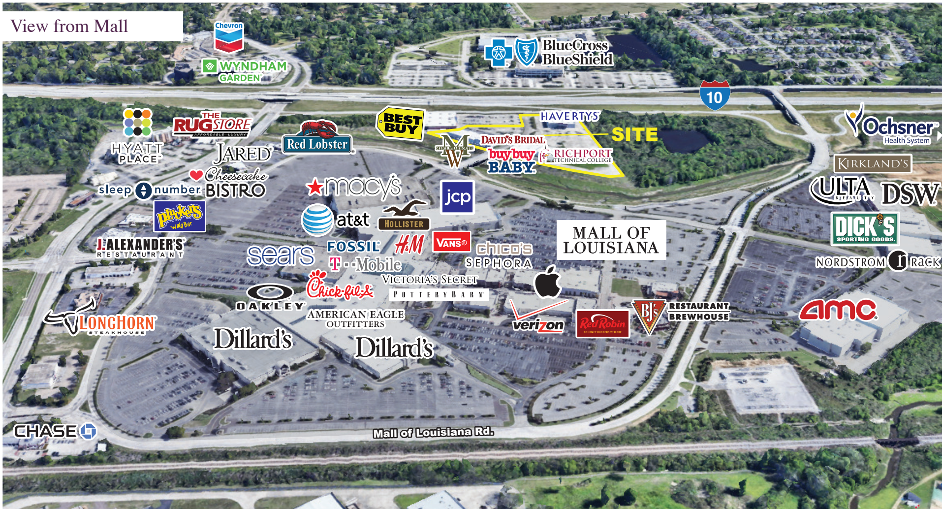
View from Mall

All information furnished is from sources deemed reliable. No warranty or representation is made as to the accuracy thereof and it is submitted subject to errors, omissions, changes of availability, price, rental or other conditions.